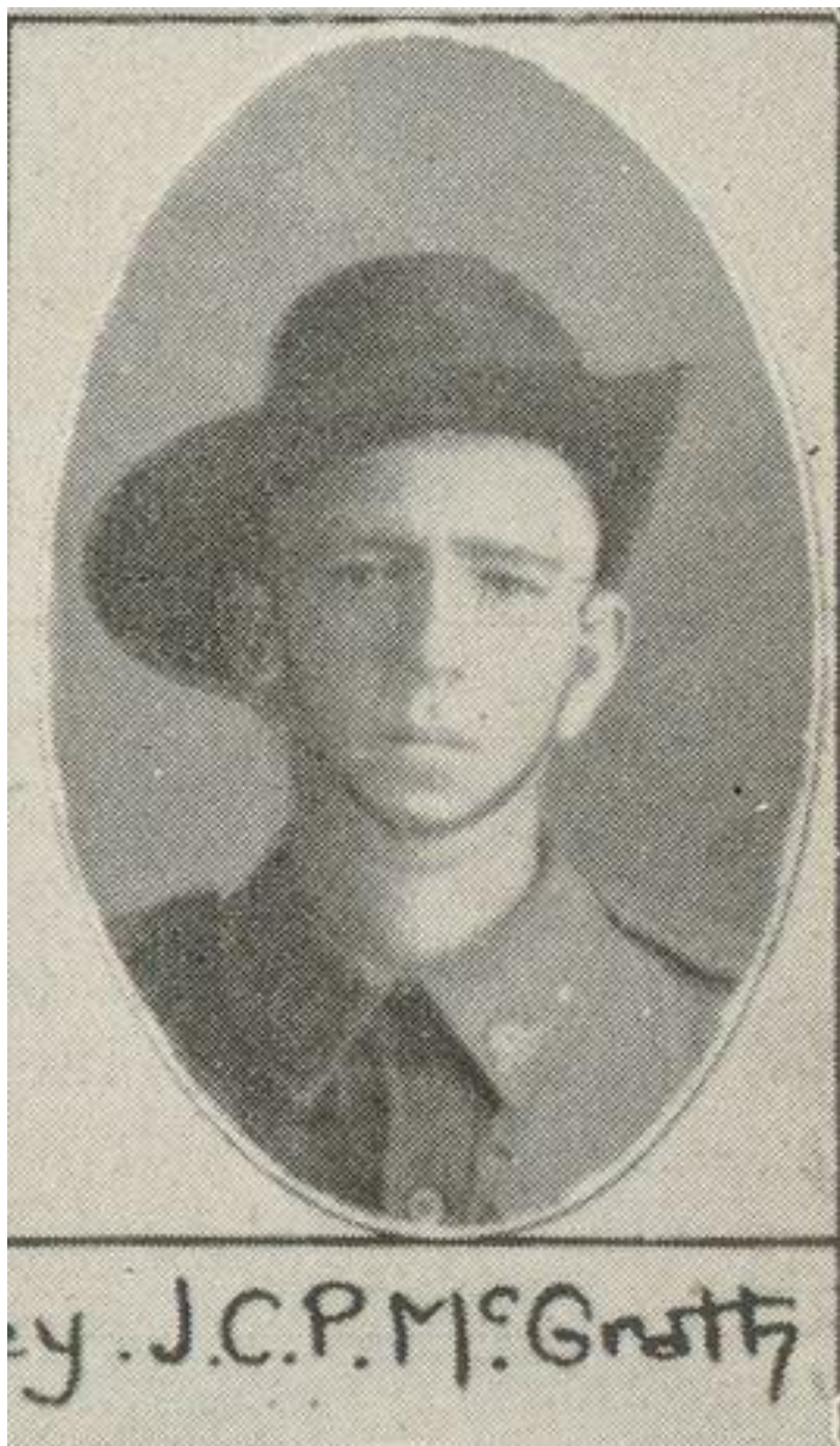
(The Queenslander 16 December, 1916)

Information obtained from the Australian War Memorial (Roll of Honour, First World War Embarkation Roll) & National Archives